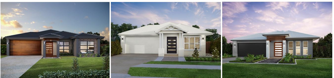
Examples of acceptable Façade Designs